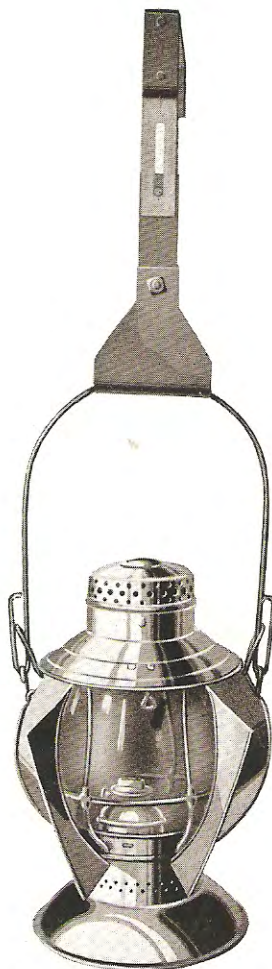
Front View of Adlake, No. 319 Gate Lantern